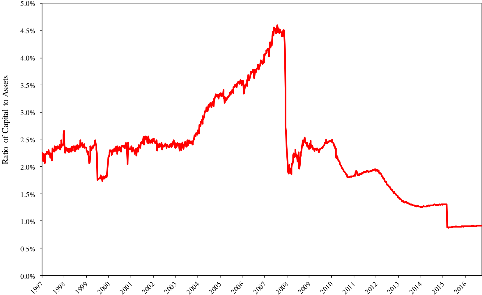
Chart 3. Federal Reserve Capital Ratio as of 01/16/19